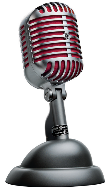
5575LE Unidyne® Limited Edition 75 th Anniversary Model